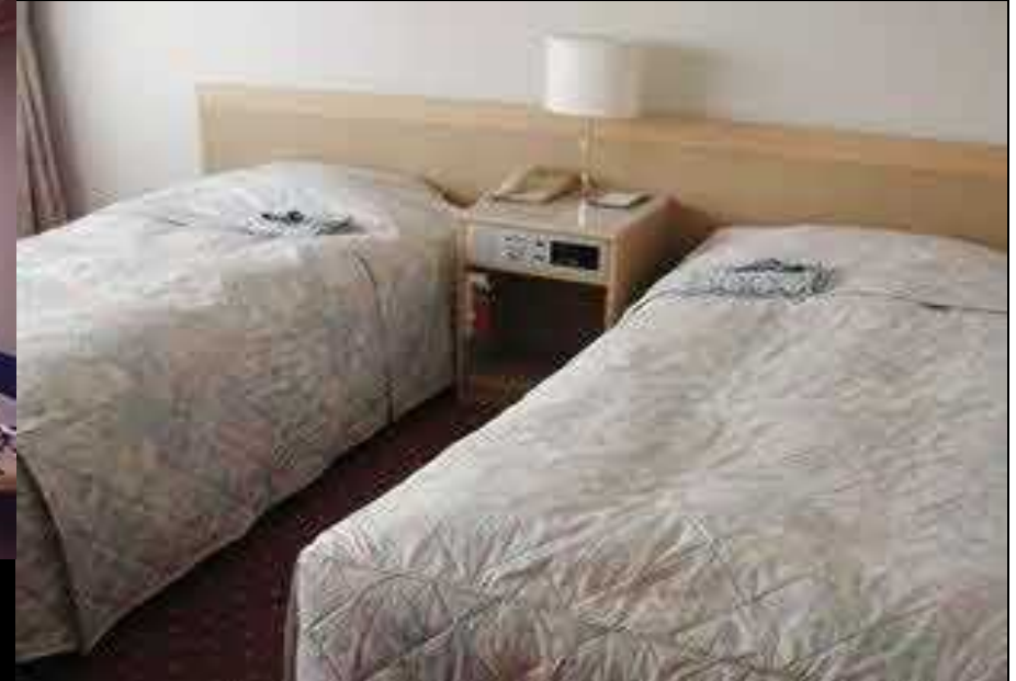
Century Plaza Hotel